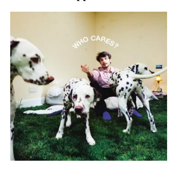
Who Cares Album Cover