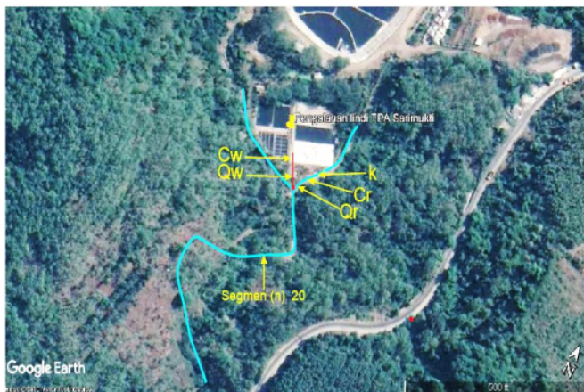
Figure 1. Location of sampling points.

The primary data collection is needed as initial data for the model equation, i.e. a river discharge that receives leachate, river discharge at the upstream part of the leachate outlet, concentration of leachate in the outlet, and phosphate concentration at a distance of 40 m from the leachate outlet. Sampling site can be seen in Figure 1. The symbol of Q_w is leachate discharge, C_w is phosphate concentration of leachate, Q_r is river discharge before leachate outlet and C_r is phosphate concentration in Cipicung River before leachate outlet.