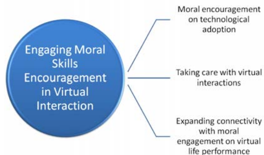
Figure 3. Model of Engaging Moral Skills Encouragement in Virtual Interaction

In addition, the field of ethics which is sensitive to the moral values involves illustrating how users should implement technological tools in addressing ethical framework to strengthen moral engagement in social media interaction. The moral engagement which should be inculcated on the virtual interaction includes equality, justice, property, and privacy. All these can be prioritised in the technological use in the form of user control. Such practices demonstrate an awareness of how information technology allows the human style on social practices which can enhance to form moral basis experiences, for instance friendship, care, commitment, and trust. It is necessary therefore to address the ethical norms relevant to how people engage in friendships online [20]. The connections between technology and human capabilities have been integrated to the feature and design of technology to enable users in utilising appropriately in the way that can be applied properly into the application context.