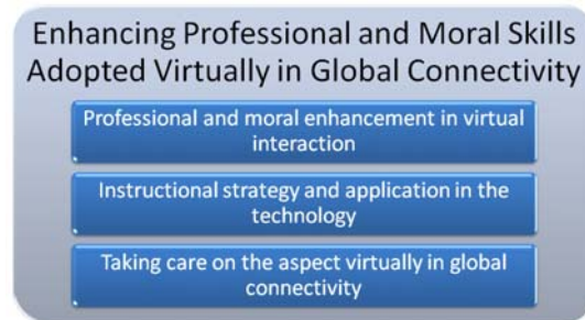
Figure 4. Model Of Enhancing Professional And Moral Skills Adopted Virtually In Global Connectivity

of their range, speed and mapping [13]. It can be described that to determine the characteristics of interaction in a virtual world can be assessed in the virtual environment which is immersed with virtual objects.