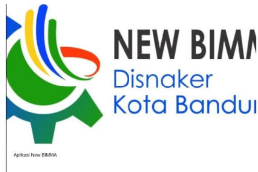
Figure 3. BIMMA Application View