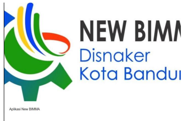
Figure 3. BIMMA Application View