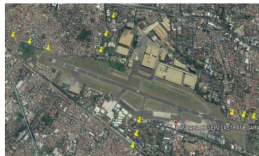
Figure 1. Sampling points.

Measurements are carried out for 7 consecutive days to get the operation of the aircraft for 7 (seven) days assuming that aircraft operations at Husein Sastranegara Airport are repeated every week. In this study, there are 12 observation points, there are three observation points in each direction of North, East, South and West of Husein Sastranegara Airport.