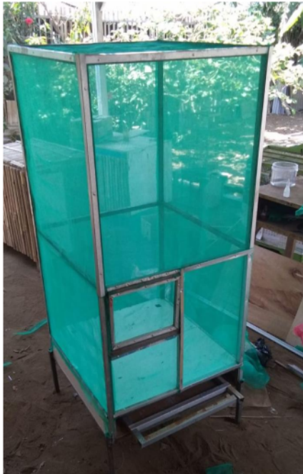
Figure 3. BSF Cage

Note: For the size of the shelf listed in the layout, it adapts to the needs of hatching bio ponds, enlargement bio ponds