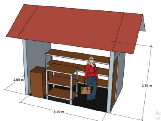
Figure 1. Schematic of Placement of Waste Treatment Plants With BSF

If necessary, both larvae and residues can be further processed to suit local market demands. This is called "product purification". Usually, the first step is to kill the larvae. However, there are other steps for larval purification, such as freezing or drying, or by separating the larval oil from the larval protein. As for the purification of the residue is usually done by composting or putting into a digester.