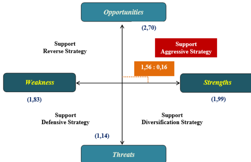
Picture 2: SWOT Analysis of the Application of Good Governance Principles in Spatial Utilization in Majalengka Regency

Based on Figure 2 above, it shows that the application of the principles of good governance in implementing spatial utilization in Majalengka Regency is currently in a favorable situation, the organization has opportunities and strengths so that it can take advantage of existing opportunities. It is more clear that the position in quadrant I illustrates that the Regional Government of Majalengka Regency currently has the strength and opportunity to realize the application of the principles of good governance in the implementation of more effective spatial planning. The strategy applied to this condition is a strategy to support an aggressive growth policy (Growth Oriented Strategy).