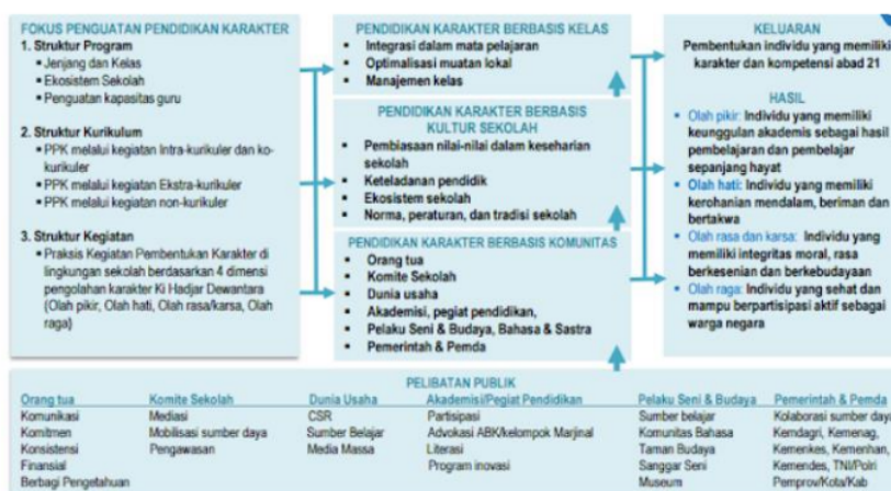
Image 1 The Basic Concept of Strengthening Character Education