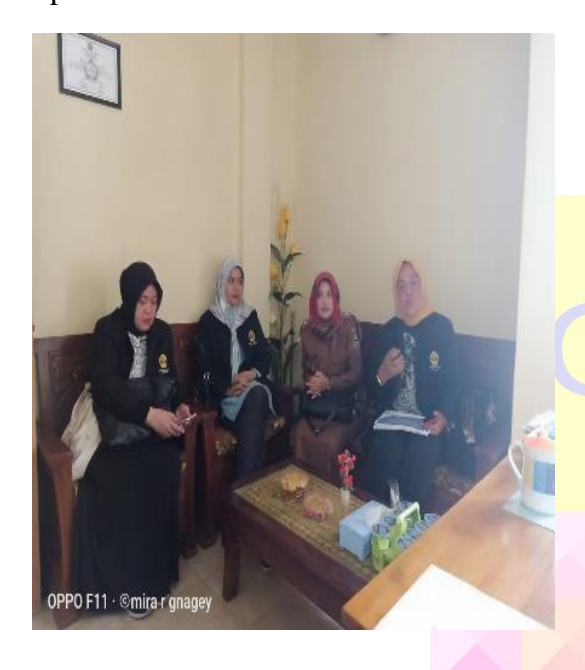
Figure 1. Counseling continued with material related to the environment.

empower youth in the village to be innovative and creative so that it can support the existence of destinations in the Tembong village environment. In this outreach the result is the village head will form a counterpart of youth with the help of the Department of Sports and Tourism and the team.