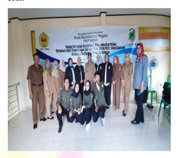
Figure 2. The final material is about leadership activities and small business management.

and beverage stalls, and secure parking lots.