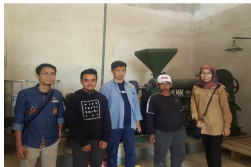
Figure 4 The PPM team and Partners visited a privately owned coffee factory in Pulosari Village

farmers really still need intensive guidance from various parties, both from academia, government and other private sectors.