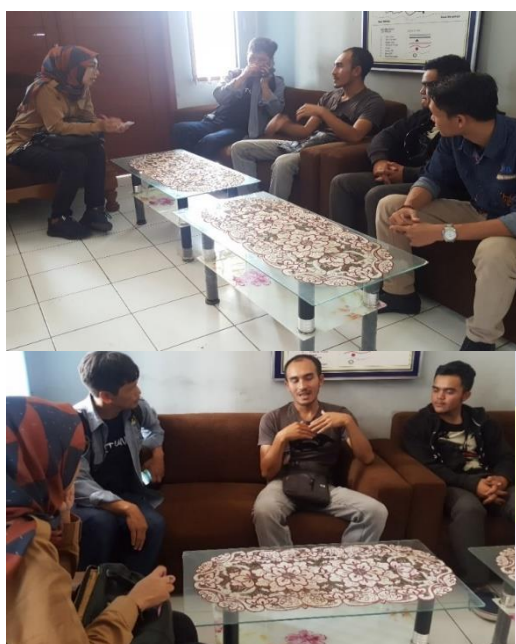
Figure 2 PPM Team and Partners when conducting FGD activities and Social Mapping for Coffee Farmer Business Development at Warnasari

separated by room. The dedication program for our team was held in the Warnasari Village office room. After the participants gathered, the team started the FGD event led by the Chairperson along with the team implementing members.