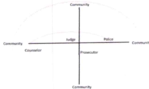
Figure 3 Sphere of Belief

Tolerance is impossible once we create partition of beliefs among law enforcers, which leads to tournament of beliefs. This is fatal to justice system. Such partition creates competition and gap that jeopardize the ongoing system. In a progressive law approach, the requirement of two set of evidence does not necessarily lead to ratio decendi, as well as scientific paradigm taught us. When a scientist holds firm to certain theory, concept, movement, or thoughts, she will act based on guided by those qualities.