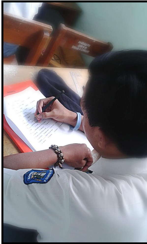
1.5 One of the students looked so confused in answering the questions