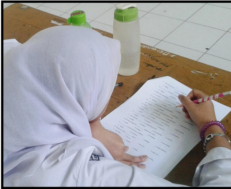
1.2 One of students was doing the test