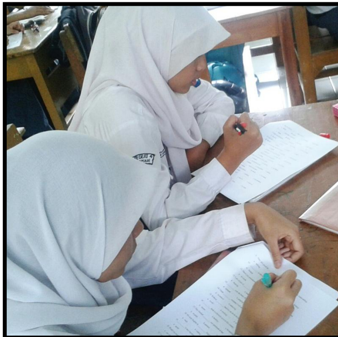
1.4 The students was doing the test