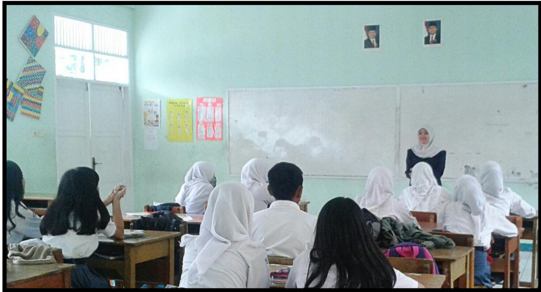
1.1 The researcher gave the instructor to the students before doing the test